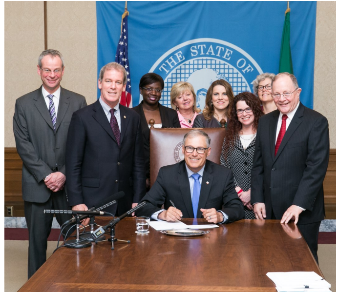
SB 5125 District Court Civil Jurisdiction Signed 5/15/15

Increases the jurisdictional limit of district courts for each claimant from $75,000 to $100,000.