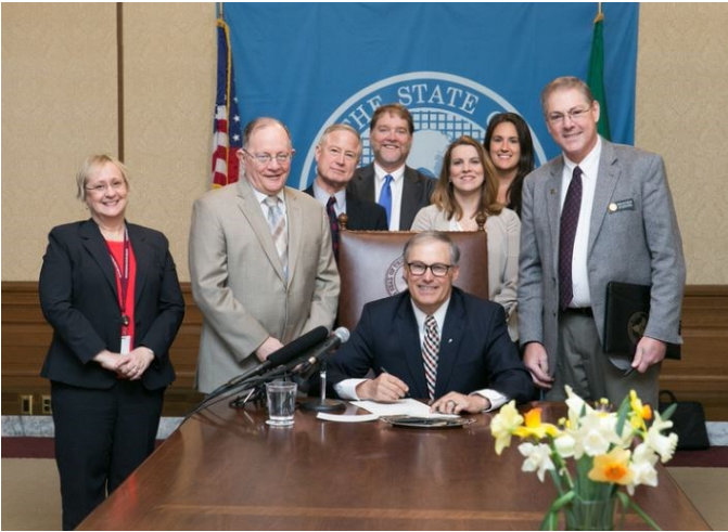
SHB 1610 Jury Service Signed 4/1/2015

the amount of jury service in a 12-month period that warrants excusal upon a subsequent summons from two weeks to one week.