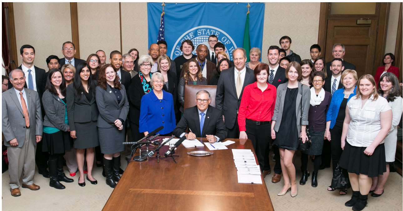
E2SSB 5564 Juvenile Records and Fines Signed 5/14/15

Provides that money received by the Department of Corrections on behalf of an inmate from family or other outside sources for the purchase of